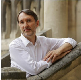
Olivier Latry