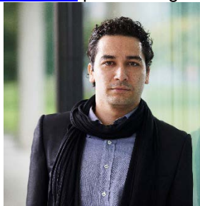
Andrés Orozco-Estrada