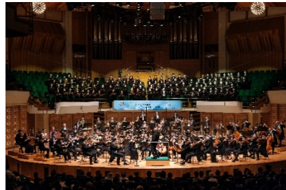
Hong Kong Philharmonic Orchestra