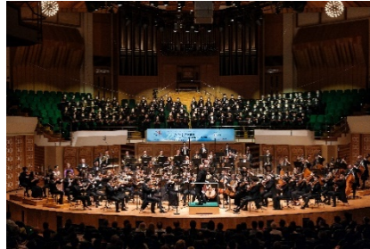
Hong Kong Philharmonic Orchestra