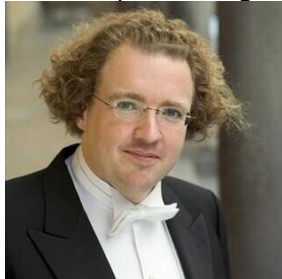
Stéphane Denève